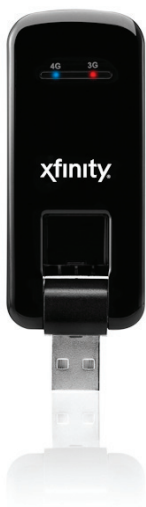
4G/3G Mobile Broadband device